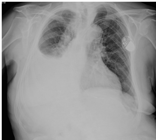
Fig. 1. Posteroanterior chest radiograph. Large right pleural effusion. Intracavitary pacemaker.

Our case was an unusual presentation of bacilli in the pleural fluid, prompting a diagnosis of pleural effusion due to BCG dissemination after intravesical instillation, 1 year after receiving this treatment. It is also uncommon for this complication to present as pleural effusion. We could only find 1 similar case of pleural