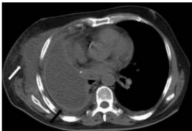
Fig. 1. Pleural empyema of the remaining cavity (black arrow) associated with an abscess contiguous with the chest wall (white arrow).