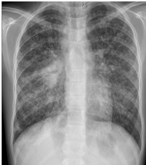
Fig. 2. Chest X-ray: diffuse alveolo-interstitial opacities, with right parahilar consolidation with central cavitation.