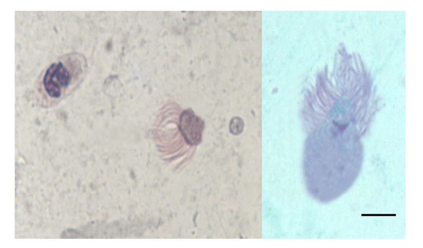
Fig. 1. Cytological sputum smear. Left: Ciliocytophthoria phenomenon, and an accompanying polymorphonuclear leukocyte (Papanicolaou, 1000 \times ). Right: Lophomonas blattarum. Bar scale 20 \, \mu m (Wheatley trichrome stain, 1000 \times ).

We provide an image to help compare these morphological criteria (Fig. 1) in which the phenomenon of ciliocytophthoria can be seen on the left, with well preserved and oriented remains of cytoplasm and cilia anchored to the terminal bar. On the right of the cytoplasmic remains, we can see what could be the nucleus of the ciliated cell. The image on the right shows a pyriform LB