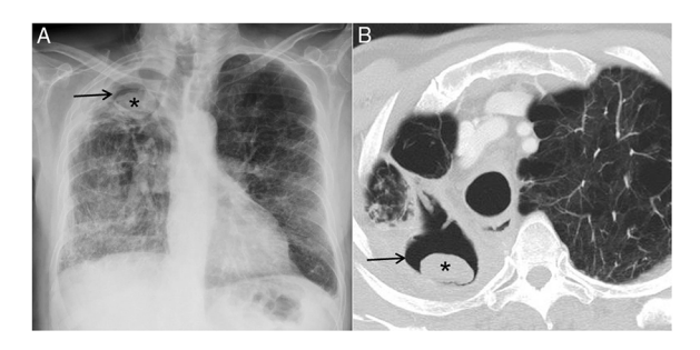
Fig. 1. Chest radiograph (A) and CT (B) show a destructive pattern of the right lung and a stable, previously documented, aspergilloma (asterisk) within a dominant right upper lobe cavity (arrow).

A 70-year-old ex-smoker man presented with low-grade fever and progressive dyspnea. His past medical history was significant for chronic obstructive pulmonary disease, combined pulmonary fibrosis and emphysema syndrome, and chronic pulmonary aspergillosis (CPA) secondary to previous tuberculosis (Fig. 1). A chest radiograph showed a stable destructive pattern of the right lung but disappearance of a previously documented aspergilloma within a right upper lobe cavity (Fig. 2A). A contrast-enhanced thoracic computed tomography (CT) confirmed the vanishing of the aspergilloma but also demonstrated the appearance of a new pleural effusion and an enhancing thickened pleural surface of the right hemithorax (Fig. 2B). A thoracentesis confirmed a fungal empyema, and a chest "pig-tail" catheter was inserted (Fig. 2C). The patient was started on voriconazole (200 mg twice daily) and has shown, six months later, an excellent response with resolution of his symptoms and of the pleural effusion.