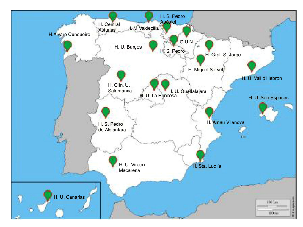
Fig. 1. Geographical location of the 19 participating centers in EPISCAN II.

x. In subjects with no evidence of airflow limitation, to compare the impact of a reduced lung diffusing capacity compared to normal diffusing capacity on health-related quality of life, exercise tolerance, systemic inflammation, and lung parenchyma attenuation.