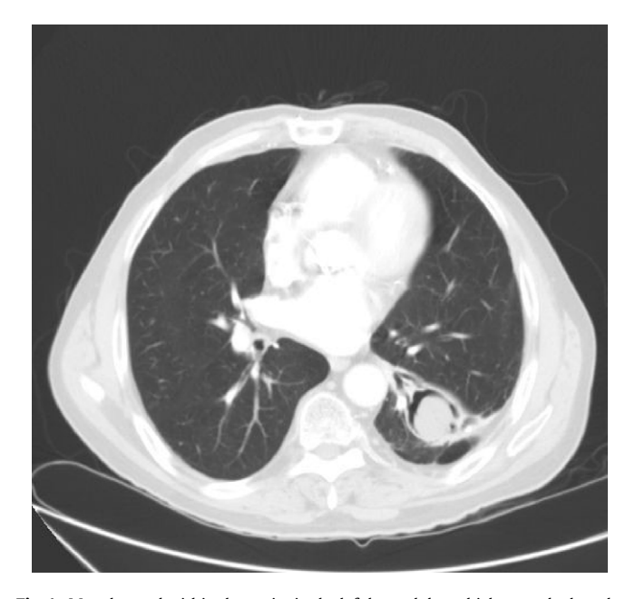
Fig. 1. Mass located within the cavity in the left lower lobe, which moved when the patient changed position, showing an air crescent sign.

S. prolificans causes infections with high mortality rates, since it is a more virulent species and resistant to practically all available antifungal agents. It is found all over the world, but fewer S. prolificans infections are reported in the north of Spain, Australia and the United States.<sup>5–7</sup> It is not part of the human microbiota, and is acquired spontaneously from exogenous sources. It has been isolated from soil samples, stagnant water, streams, and from contaminated environments in general.<sup>5</sup> The most common routes of entry are the inhalation and aspiration of conidia. Both the S. apiospermum/P. boydii complex and S. prolificans are important emerging opportunistic pathogens that have been related with a growing number of cases of infection and can colonize surfaces, ducts or cavities.