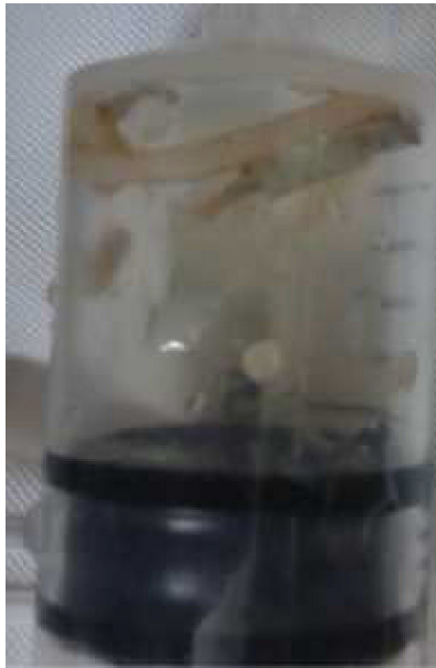
Fig. 2. Ascaris worm in pleural biopsy syringe.

radiograph showed bilateral pleural effusion and bilateral pulmonary infiltrates in both lung fields. A computed tomographic (CT) scan showed bilateral pleural effusion and bilateral consolidation involving upper lobes, middle lobe, and lingula (Fig. 1). White cell count 96 000 with 75% eosinophils. Abdominal ultrasound showed splenomegaly with simple splenic cyst. Stool examination revealed amebiasis. A repeat stool examination showed ascaris ova. Based on the clinical and laboratory findings, diagnosis was ascaris infestation. Pleural biopsy was scheduled to diagnose chest pathology. An 8 cm long, grayish white worm was seen emerging from the pleural biopsy needle during percutaneous aspiration of pleural effusion (Fig. 2). The worm was identified as Ascaris lumbricoides , so treatment with albendazole 400 mg for 3 days was started. Follow up CXR show marked improvement of pulmonary opacities and right sided pleural effusion with residual left pleural effusion.