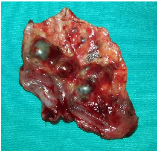
Fig. 2. Endometriotic foci on the diaphragm surface and gross image of the resected piece.

diagnosis was “endometrial tissue in the lung parenchyma, suggestive of pulmonary endometriosis”. Three years after the procedure, the patient remains free of symptoms and has had no relapse.