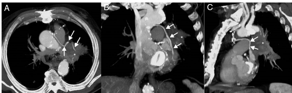
Fig. 1. Axial (A), coronal (B), and sagittal (C) maximum intensity projection (MIP) thoracic CT images (mediastinal window) show a left hilar mass (asterisk) encasing the left internal mammary artery graft to the left anterior descending coronary artery (arrows).

Although very rare, supraventricular arrhythmias may be the presenting symptom of lung cancer. We believe that physicians should keep this important differential diagnosis in mind when patients have an unexplained persistent AF, especially in cardiac patients with risk factors for lung cancer.