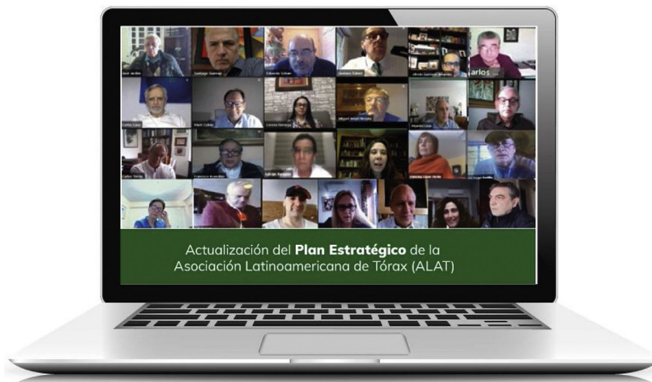
Figure 1. Participants in the ALAT Strategic Plan 2021–2026.