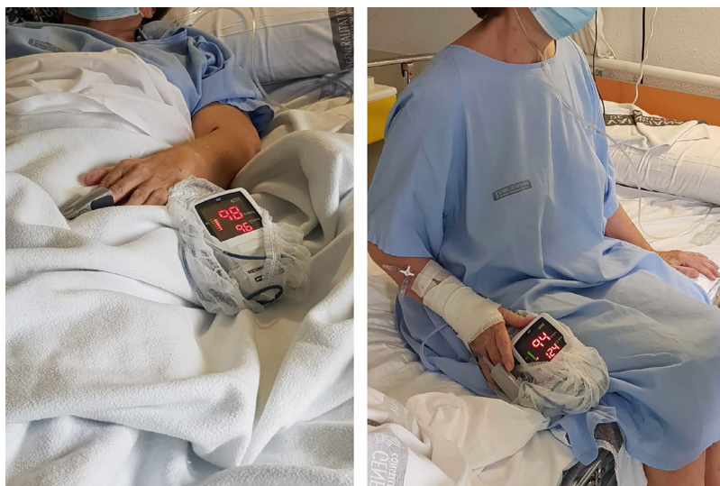
Figure 1. The difference in saturation in sedation from decubitus and the increase in heart rate can be observed.

no reports have appeared in the literature to date that relate POS with the anatomical and functional alterations associated with severe COVID-19 pneumonia.