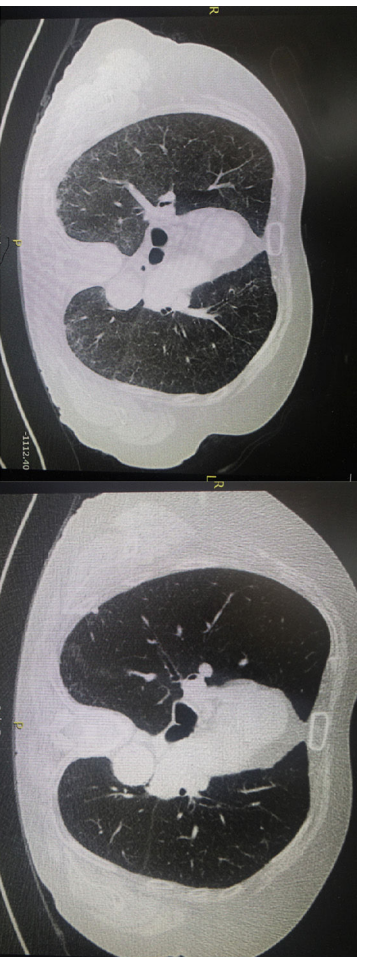
Fig. 1. Left image: Chest CT scan showing diffuse bilateral areas of ground-glass opacity without architectural distortion, lymphadenopathy, or other abnormalities. Right image: Resolution of radiographic abnormalities after 3 months of withdrawal of MTX treatment.

necessary but pulmonary histology is characterized by alveolitis with epithelial cell hyperplasia and eventually, small granulomas and eosinophilic infiltration.