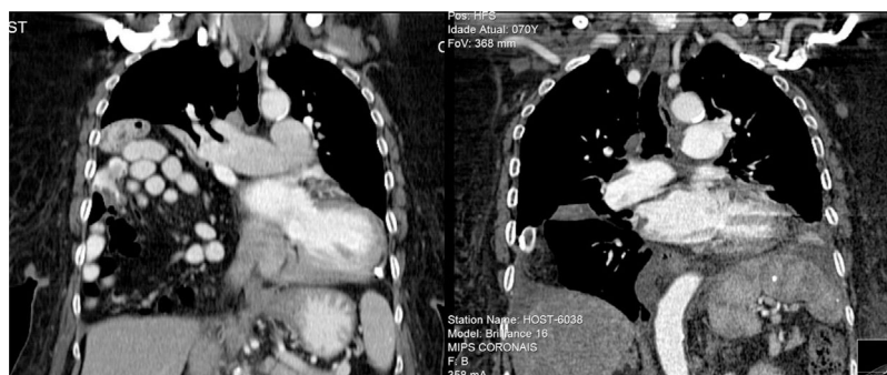
Fig. 1. Computer tomography scan before and immediately after surgery showing the right lung expansion (at the right).

On the other hand, there is no consensus or guidelines on surgical timing in non-acute cases. Although the majority of these hernias are asymptomatic, repair is recommended to avoid future complications 2,3 and may improve lung function 6 as we were able to demonstrate. Surgical intervention may also reverse chronic respiratory failure as Tone et al. 5 report and we also found in this