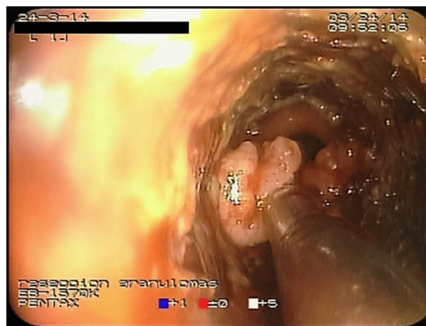
Fig. 1. Microdebrider tip resecting a granuloma in the distal end of the metal prosthesis.

Rotation speed is controlled manually or by a pedal (1500–5000 rpm). Drawbacks include its length, which at 37 cm