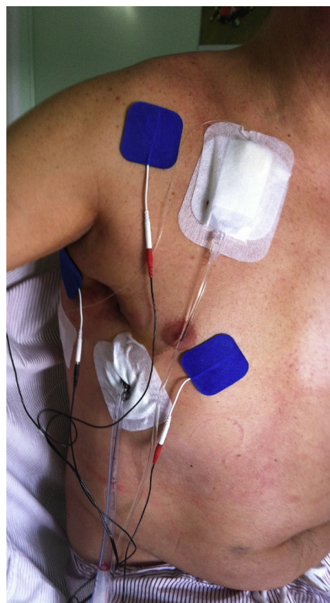
Fig. 3. TENS placement.