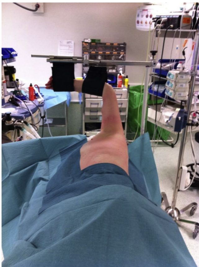
Fig. 2. Standard positioning of patient in the operating room.