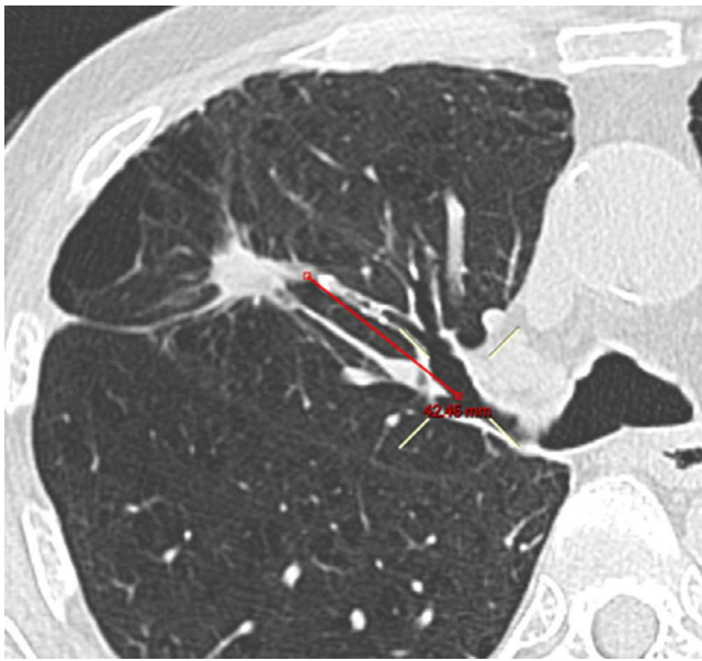
Fig. 2. Reformatted image used for the calculation of the distance of a nodule from the hilum.

frequently being compatible with mediastinal-EBUS/EUS or urological/gastroenterological ultrasound systems), the purchase of a small, reusable (50 acts) EBUS probe provides a low-cost system of guidance and real-time PPL visualization (€3300 for Olympus products). The examination is rapid, adding 1–5 min to the procedure, and it is performed under light sedation in an outpatient setting. The DY is slightly lower than reported by Eberhardt or Ishida et al., but the simplicity of the procedure could justify its first-line use, reserving more complex methods for cases of negative and doubtful results.