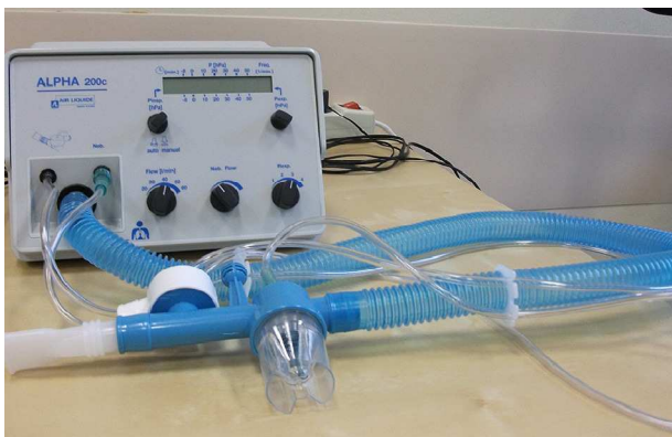
Fig. 3. The latest IPPB used for the study (Alpha 200C, Air Liquide).