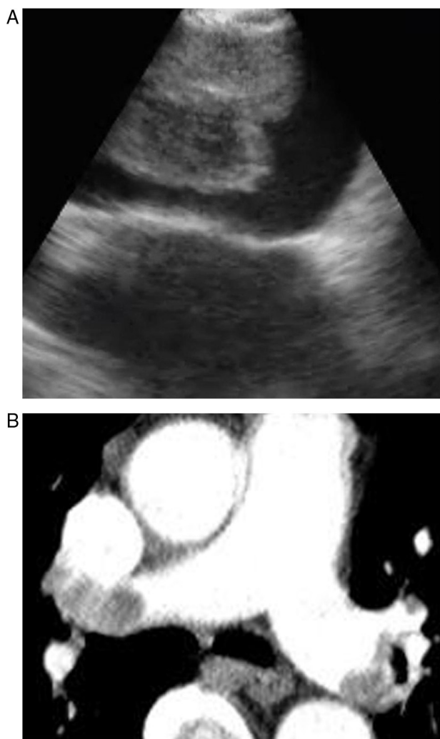
Figure 1. (A-B) Images of an embolism in the right pulmonary artery on the EBUS.

lymphadenopathies and a PE in the left main pulmonary artery. EBUS-FNA of the lesion and lymph nodes was performed; during the EBUS, the thrombus was seen in the left main pulmonary artery. Squamous metaplasia was observed in the histopathological examination.