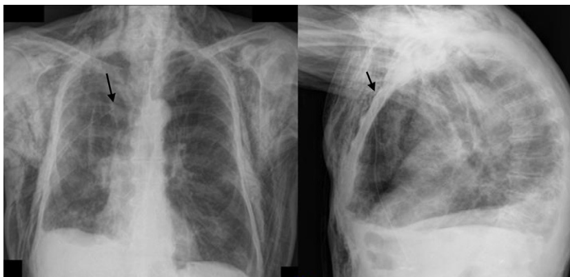
Fig. 2. Posteroanterior and lateral chest radiography showing massive accumulation of air in the subcutaneous tissue. The proximal end of the subcutaneous drain can be observed in the third right intercostal space (arrows).