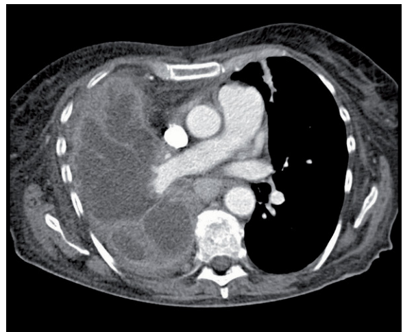
Figure 1. CT showing complete occupation of the RUL, persistent lymphadenopathies, mediastinal invasion and pleural effusion.

The spectrum of this type of neoplasm is extensive, having been described with multiple denominations. 1,2 Perhaps the simplest classification is to group these tumors in accordance with the WHO into three entities: mucinous cystadenoma (localized cystic mass, full of mucus and surrounded by well-defined columnar mucinous epithelial wall), mucinous cystic tumor with atypia (invasive growth of the subjacent tissue with significant atypia and marked pseudostratification) and mucinous cystadenocarcinoma (cystic adenocarcinoma with abundant production of mucus that follows a pattern similar to that described in ovarian, breast and pancreatic tumors). 1 In most cases, the findings are incidental, asymptomatic and with no compromised lung function. 3 They are generally slow-developing, although cases have been described of progression, and even of metastasis and recurrences. 1,2 Radiography and thoracic CT are essential for the diagnosis. 2 Their confirmation is made by means of pathologic anatomy. 5 The differential diagnosis is extensive, including bronchogenic cyst, mucus gland adenoma, mucoepidermoid carcinoma, mucinous bronchoalveolar carcinoma or mucinous adenocarcinoma metastasis. Treatment is based on complete resection of the tumor. Radiotherapy and chemotherapy seem to play a limited role in non-resectable tumors. The general prognosis is good, 4,5 with an approximate survival rate of 75% at 5 years and 50% at 10 years.