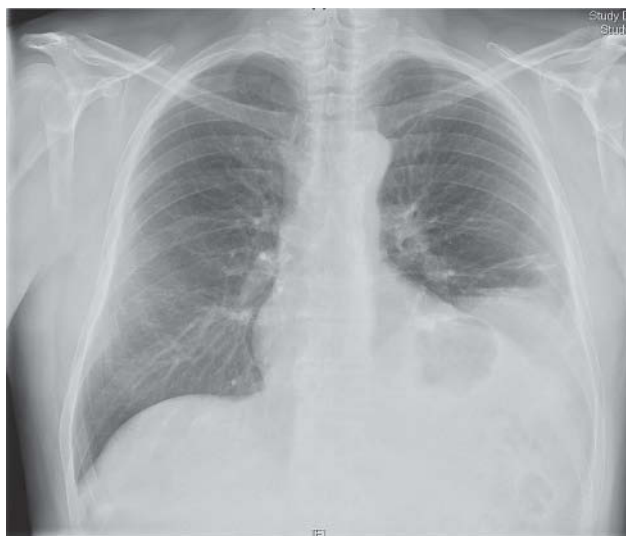
Figure 1. PA chest x-ray showing elevation of the left hemidiaphragm.