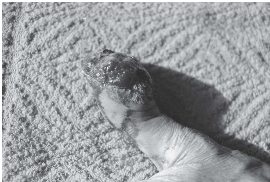
Figure 1. Acrometastasis of the left thumb.

Acrometastasis normally appear during a very extended disease, and suggest an ominous prognosis. The treatments used for palliation include systemic chemotherapy, curettage, amputation of solitary lesions that grow in distal phalanges and short bones when there is no response to analgesia and radiotherapy (reserved for multiple lesions). Treatment is aimed at relieving pain and restoring function. 6 Due to the deceptive characteristics mentioned above, many cases are not initially diagnosed. Persistence of symptoms, lack of response