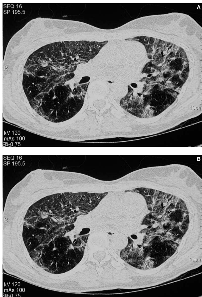
Figure 1. A, high resolution computed tomography (HRCT) scan revealing distorted bronchial architecture, bands of fibrosis, and incipient honeycombing in both lung bases. B, follow-up HRCT scan showing complete resolution of the pulmonary lesions.

The macroscopic findings of the fiberoptic bronchoscopy were normal and bronchoalveolar lavage fluid analysis showed 40% macrophages, 20% lymphocytes, 10% neutrophils, and 30% eosinophils. Pathologic analysis of a transbronchial biopsy specimen taken during the bronchoscopy showed partially distorted pulmonary architecture with focal areas of fibrosis and a considerable chronic