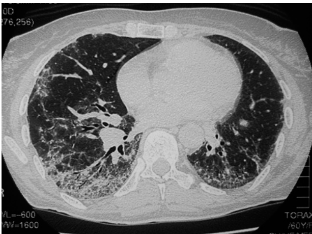
Figure 1. High-resolution computed tomography showing a bilateral interstitial pattern, with septal enlargement, areas of ground glass opacity, reticulation, and traction bronchiectasis with predominance in the lower lobes.