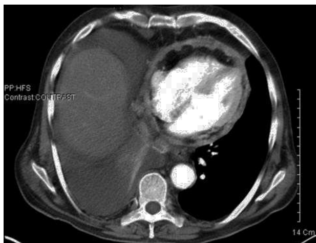
Figure 1. A chest computed tomography scan showing irregular circumferential thickening of the pericardium with no effusion, indicative of constrictive pericarditis. Right pleural effusion is also visible.

red cell count of 28 800 cells/ \mu L, a white cell count of 160 cells/ \mu L, a glucose concentration of 115 mg/dL, a protein concentration of 2.9 mg/dL, a lactate dehydrogenase (LDH) level of 181 U/L, cholesterol level of 48 mg/dL, and adenosine desaminase of 14.5 U/L. According to Light's criteria, the fluid was a transudate (pleural fluid protein/serum protein ratio, 0.47; pleural fluid LDH/serum LDH ratio, 0.59). Pleural fluid cytology was negative for malignancy.