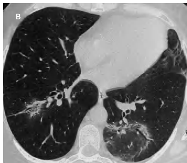
Figure 2. High-resolution computed tomography of the point of entrance of the pulmonary veins (A): ground glass opacity with dilated bronchioles in the middle lobe and peribronchovascular pseudonodular consolidation with the halo sign in the lower right lobe. Axial scan of 1mm collimation at the level of the basal pyramids (B): pseudonodular parenchymal consolidation with reversed halo sign in the left lower lobe and to a lesser extent in the right lower lobe.

22-87 years). Diagnosis was made with open lung biopsy in 28 patients and transbronchial biopsy in the remaining 6. HRCT was performed on all patients with a Somatom Plus 4 A scan (Siemens Medical Systems, Forchheim, Germany) following established guidelines: 1-mm collimation at 10-mm intervals, high resolution reconstruction algorithm, with kilovolts and milliamperes adjusted to the patient's weight. Of the 34 patients studied, 25 (73%) had no associated diseases and they were therefore classified as having cryptogenic organizing pneumonia. Of the 9 remaining patients, organizing pneumonia was secondary to rheumatoid arthritis in 2, breast cancer treated with chemotherapy in another 2, and bone marrow transplant in another 2. One patient had had zoster herpes treated by carbamazepine, 1 presented polymyositis, and 1