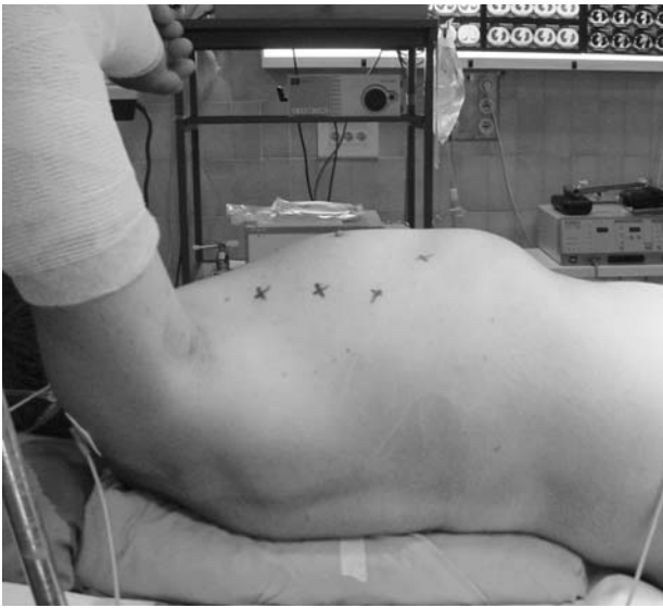
Figure 1. Position of surgical ports.

mortality rates dropped nearly 50% in the first years after Sauerbruch 2 began performing surgical interventions in 1912. In 1939, Blalock et al 3 proposed the systematic use of thymectomy after demonstrating a clear relation between thymectomy and improvement of MG. The introduction of new techniques and specialized intensive care has improved results considerably; the death rate from the condition has fallen from 10% in the 1970s to the current rate of 0% to 2%. 4