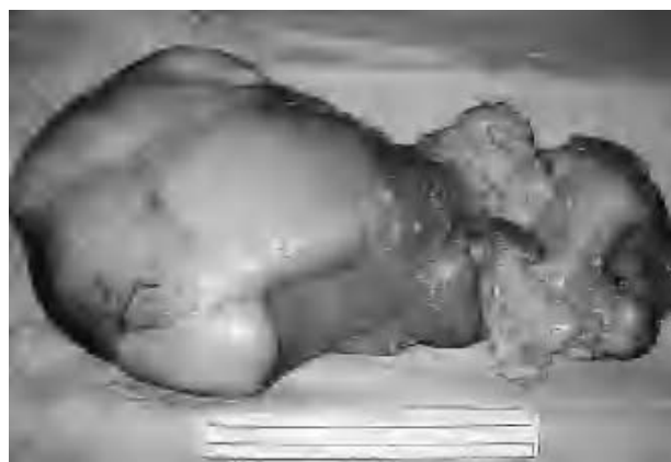
Figure 2. Photograph of the resected block: thymolipoma.

These tumors are often confused with cardiomegaly in a simple x-ray, as happened in our case. 9 To differentiate thymolipoma from lipoma, thymic hyperplasia, and liposarcoma, computed tomography or