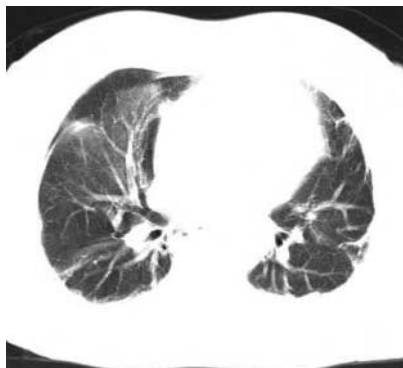
Figure 2. High resolution computed tomography scan of the thorax.

considered one of the most potent proinflammatory cytokines. Blocking it rapidly neutralizes inflammatory signs and symptoms (fever, elevated C-reactive protein levels, anemia, and more) and TNF- \alpha blockers are therefore used as an additional treatment in these processes so that the usual immunodepressant therapy can be reduced. 4