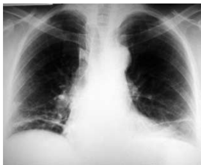
Figure 1. Simple chest radiograph.

The anti-inflammatory effects of TNF blockers have led to their use in a variety of inflammatory diseases (chronic juvenile arthritis, adult Still's disease, psoriatic arthritis, Crohn's disease) although the original indication was rheumatoid arthritis. TNF- \alpha plays a central role in inflammation and is