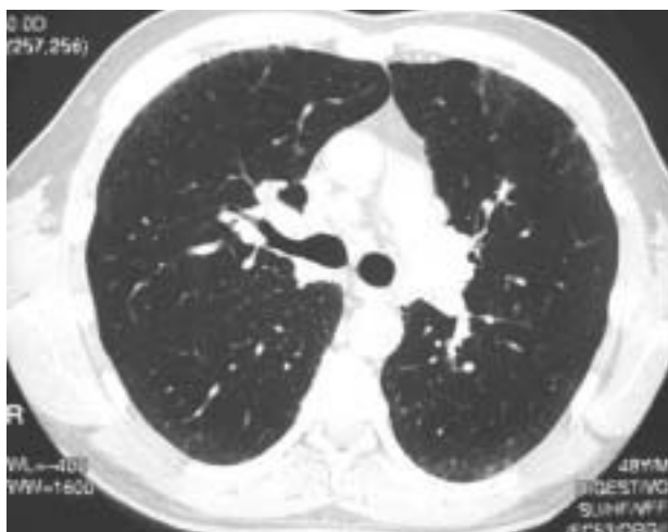
Figure 1. Infiltrate on ground glass opacities and affected hilar nodes.