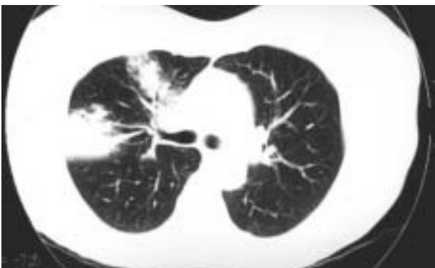
Figure 3. Computed tomography scan showing lung nodules with some areas of cavitation.

admittance to the respiratory medicine ward for further evaluation.