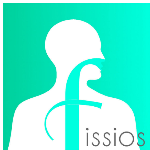
Fig. 1. Fissios App Logo.