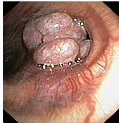
Figura 1. Imagen obtenida durante la broncoscopia donde destaca la presencia de una tumoración polilobulada a la entrada del bronquio principal izquierdo.

Este tipo de tumores suele comenzar con una gran variedad de sintomatología, en la que destaca la hemoptisis 4 . Las pruebas de imagen, sobre todo la tomografía computarizada (TC) con y sin contraste y la resonancia magnética (RM) 1,2 , ayudan a visualizar la