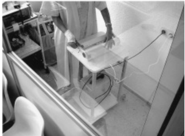
Fig. 1. Provocation chamber and shrink wrapping machine used in the specific challenge test.

Most industrial processes using PVC involve heating the product in order to take advantage of its physical properties. This heating process can give rise to the release of PVC in gaseous form and of irritative products such as hydrochloric acid and carbon monoxide. Exposure to these agents can cause acute intoxication in the central nervous system and irritative