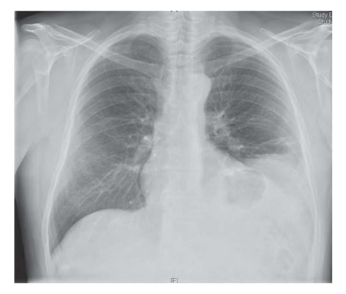
Figure 1. PA chest x-ray showing elevation of the left hemidiaphragm.