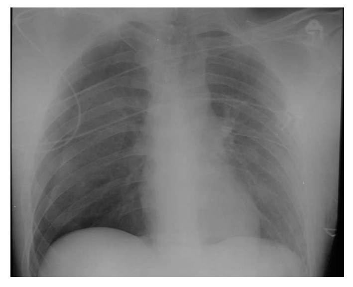
Figure. Posteroanterior chest x-ray: chest tube in the left hemithorax with complete reexpansion of the left lung and appearance of a new right pneumothorax over 3 cm long.

Finally, a pleural window may have communicated with both pleural spaces.<sup>3</sup> The window might have been embryonic in origin (due to a defect in the fusion of the pleuropericardial folds in the fifth week of development), or a complication of cardiac and thoracic surgery. In patients with unilateral pneumothorax, this window permits the passage of air from one side to the next, causing bilateral collapse. Our patient had bilateral bullae, however, and pleural windows are typically found in patients with unilateral disease. Although the pleural defects were predominantly left-sided in our