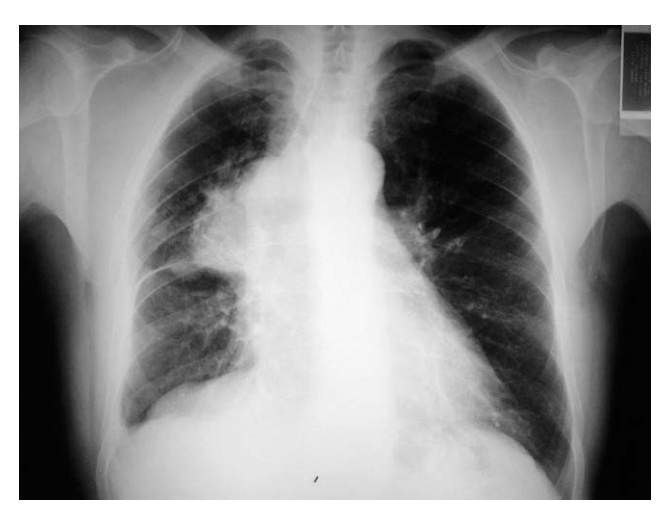
Figure 1. Large mass in the right hilum, responsible for loss of right lung volume.

The chest radiograph showed a mass and reduced right upper lobe volume (Figure 1). The CT scan confirmed the presence of a right upper lobe bronchial tumor measuring 5\times 3.5\,\mathrm{cm} across, and malignant mediastinal lymph node disease with no sign of abdominal metastasis. Bronchoscopy found a mass causing stenosis of the right upper lobe bronchus (Figure 2). Bronchial biopsy confirmed an IgA kappa-type plasma cell malignancy. No abnormalities were observed