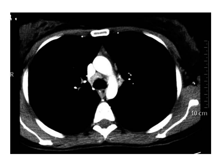
Figure. Computed tomography.

A 27-year-old woman was evaluated in the internal medicine department for a 3-month history of fever, mainly in the evening, night sweats, and nonpruriginous maculopapular lesions. Physical examination was normal, with no evidence of cervical or supraclavicular adenopathy. Laboratory tests showed no abnormalities. Agglutination tests for Typhi and Brucella were negative, as were antibody titers against Epstein-Barr virus, rheumatic and immunological tests, and the Mantoux test. A computed tomography scan of the chest and abdomen revealed small peripherally distributed subpleural nodules (the largest measuring 9 mm in diameter) in the right lung, discrete paratracheal and bilateral hilar lymph nodes, and an enlarged subcarinal lymph node (Figure). Fiberoptic bronchoscopy was normal. Microbiology and cytology of transbronchial and bronchial biopsy samples and bronchoalveolar lavage fluid did not provide conclusive findings.