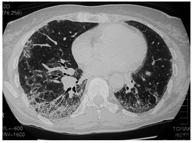
Figure 1. High-resolution computed tomography showing a bilateral interstitial pattern, with septal enlargement, areas of ground glass opacity, reticulation, and traction bronchiectasis with predominance in the lower lobes.