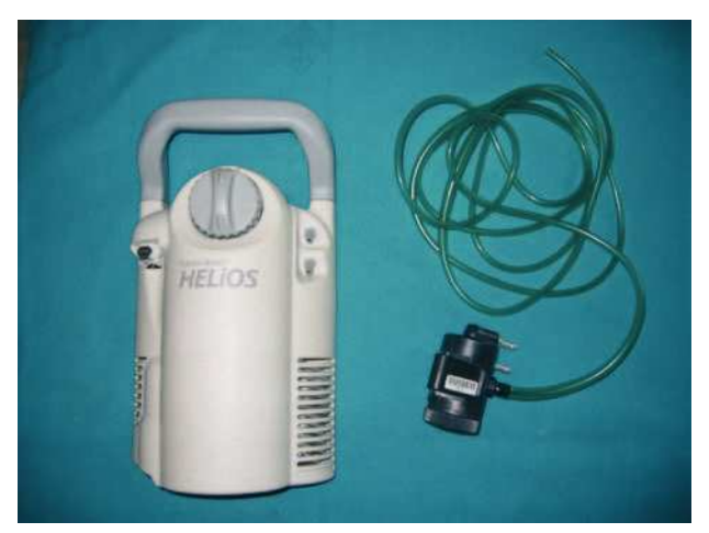
Figure 2. Demand oxygen delivery systems: valve fitted on liquid oxygen tank (left) and independent valve (right).

Demand oxygen delivery systems were developed at the beginning of the 1980s and are perhaps the most