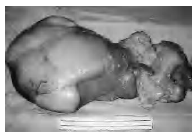
Figure 2. Photograph of the resected block: thymolipoma.

These tumors are often confused with cardiomegaly in a simple x-ray, as happened in our case. To differentiate thymolipoma from lipoma, thymic hyperplasia, and liposarcoma, computed tomography or