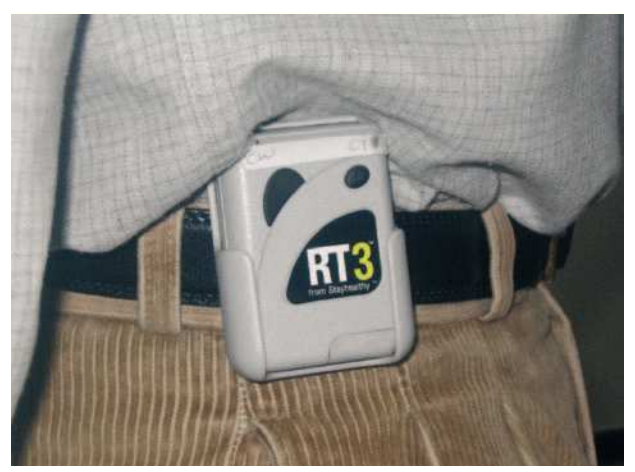
Figure 1. RT3 accelerometer attached to a study participant's belt.

such as the ability to perform everyday tasks, healthrelated quality of life, and health resource utilization, however, is weak or absent.<sup>7-9</sup> Most of the limitations experienced by COPD patients are related to dyspnea<sup>10-12</sup> and an impaired ability to exercise.<sup>13-16</sup> The final consequence is a progressive reduction in everyday physical activity.