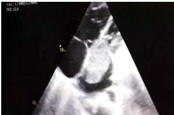
Fig. 1. Echocardiography showing a large mass in the left atrium (6.3×3.2 cm) in diastole protruding into the left ventricle.

clots. A thrombophilia study was also requested, and the patient was found to be a heterozygous carrier of the factor V Leiden mutation.